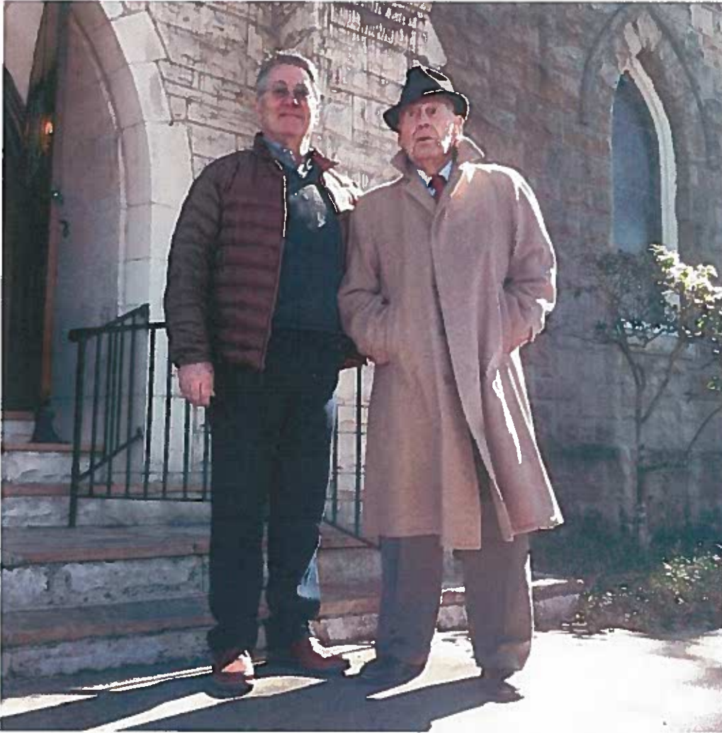
Two Guys walk into a church....