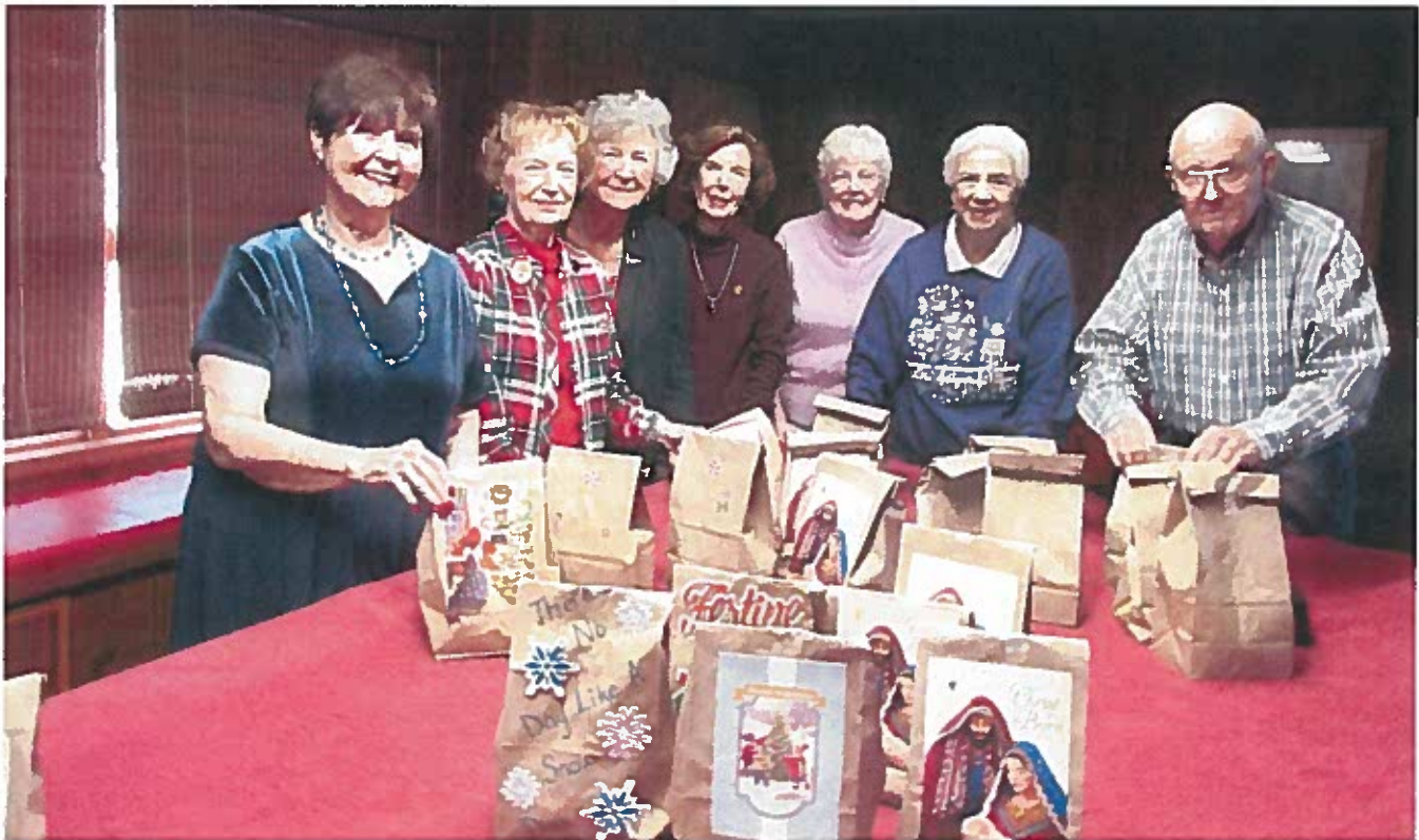
Bell ringers for the Salvation Army

Ladies of Good Shepherd and St. Michael and All Angels Church prepared gift bags for the residents of Rosewood Nursing Home.