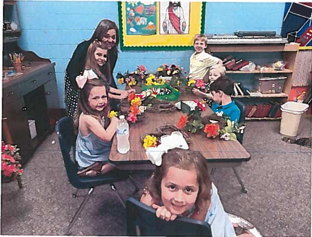
Sunday School classes made heart/ flower wreaths for their moms on Mother's Day.