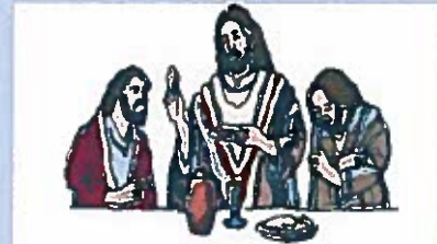
"The Upper Room ..."

Join us Sunday Mornings at 9:30 a.m. The Ten Commandments: