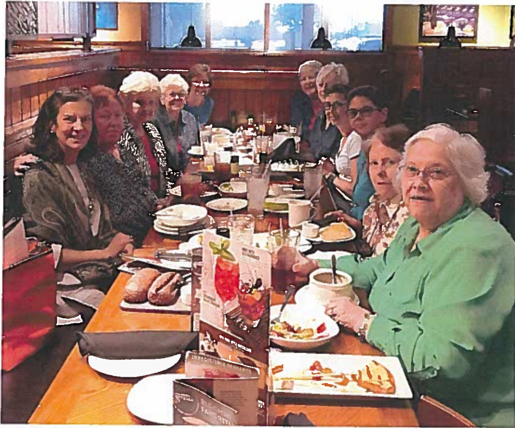
Ladies Lunch Bunch at Outback.