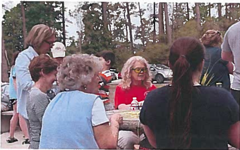
Palm cross folding at St. Andrew's March 24.